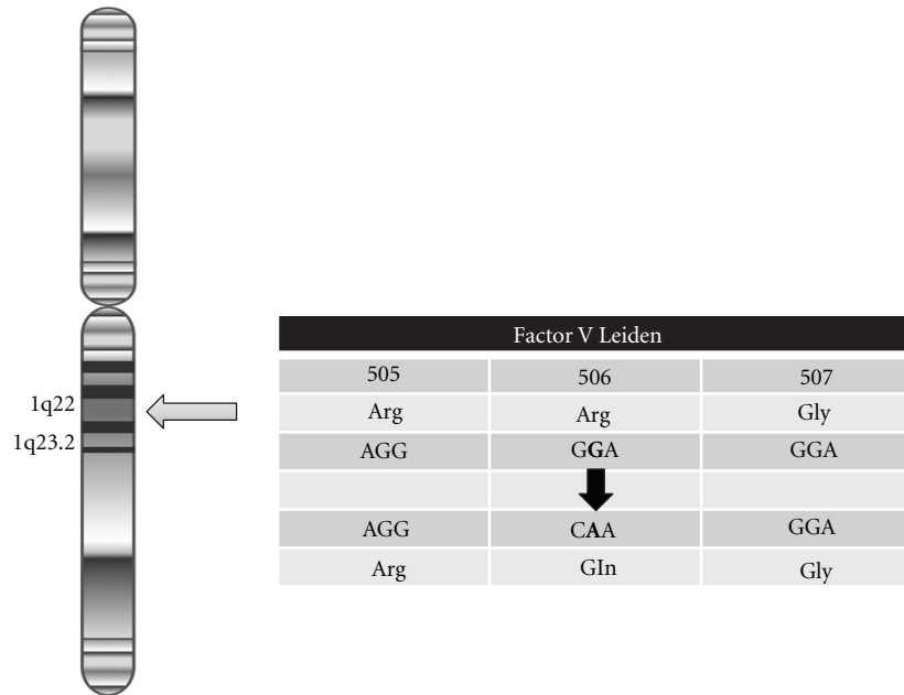
FIGURE 2: FV gene. The FV gene is located on the long arm (q arm) of chromosome 1 at position 23. This mutation results of a single change in one aminoacid (single nucleotide polymorphism; SNP) in the factor V protien. Specifically an arginine is replaced by a glutamine at protein position 506 (Arg506Gln or R506Q).

on this coagulation protein occurs: single change of one aminoacid at position 506; an arginine (Arg) is replaced by a glutamine (Gln) (see Figure 2) [26]. As a result of this, the mutation leads to a loss of anticoagulant cofactor function of APC on FV with clotting mechanisms remaining active for more prolonged periods and a subsequent increase of the formation of pathological blood clots. This is the reason why FVL disorder was initially described as APC resistance, although the FVL mutation is only found in about 80–90% of cases diagnosed with this condition [6, 27, 28].